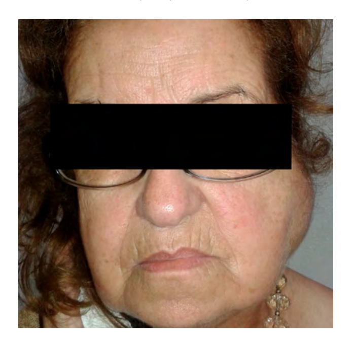
Figure 1. Diffuse enlargement of left parotid gland, with preauricular and infra-auricular distribution (6x7cm), hard consistency and immoveable.