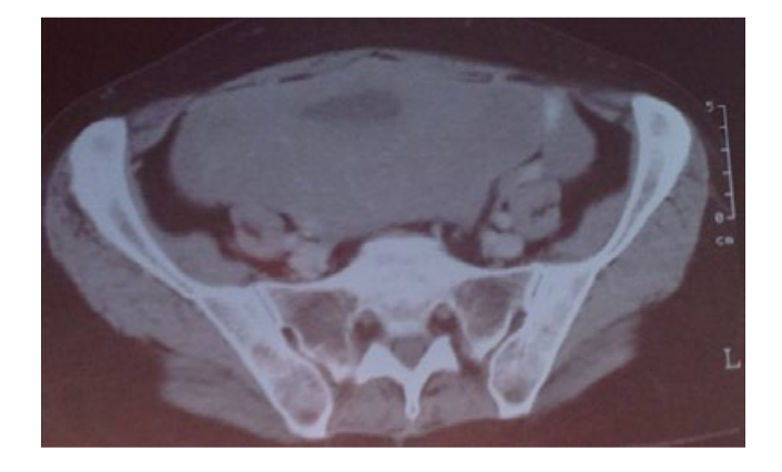
Figure1. CT scan os abdominal cavity

Blood tests documented anemia (Hb 7.1 g/dl, MCV 85.5 fL, MCH 32.4 pg). She underwent another emergent exploratory laparotomy which showed an extensive intra-peritoneal bleed. New peritoneal biopsies were performed and confirmed metastatic GIST and resection with microscopic residual disease (R1) was carried out. Genetic testing showed exon 11 mutation. PET scan showed positive mediastinal nodes. Palliative chemotherapy with Imatinib Mesylate 400mg/day was started in January 2004, assuming residual disease. The patient maintains therapy with Imatinib 400mg/ day for approximately 10 years without any side effects. The last CT scan in October 2015, showed no evidence of recurrence of the disease and the blood tests remain normal.